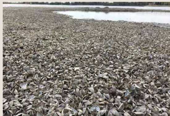
Lake Winnipeg, 2018

Beach spoiled with rotten mussels smell and sharp shells.