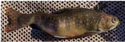
Trout infected by Whirling Disease