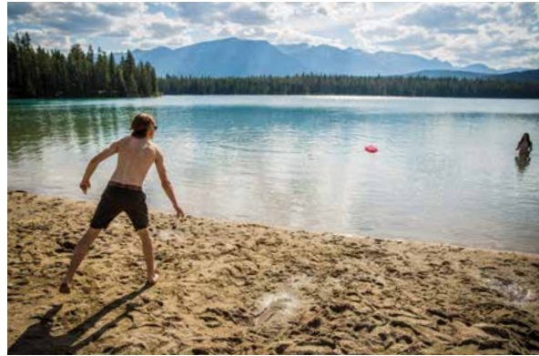
Lake Annette, Jasper