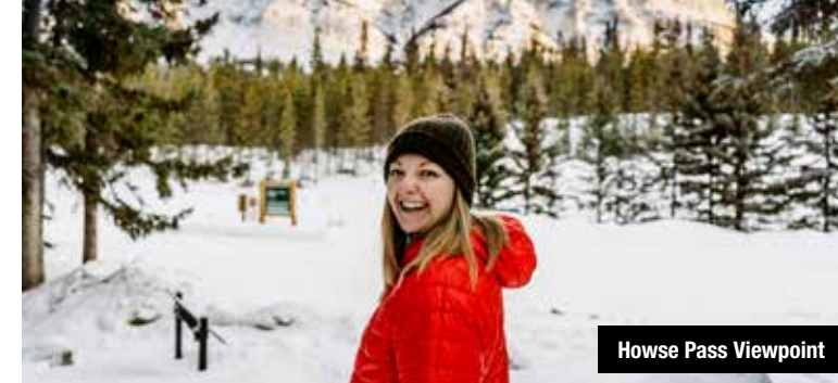
Howse Pass Viewpoint

A short stroll to a magnificent view over the North Saskatchewan and Howse river valleys.