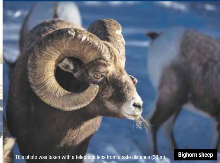
This photo was taken with a telephoto lens from a safe distance (30 m).

Before you venture out on the Parkway this winter, please be prepared and check the road condition reports. Drive with caution and enjoy the breathtaking beauty that awaits you on your journey through ice and time.