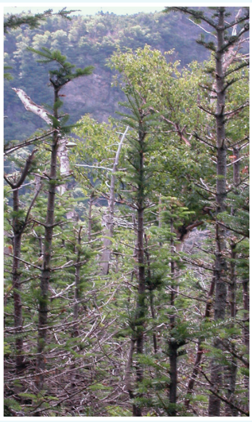
Young fir trees with branches browsed to the trunk.

Normally, boreal forest regenerates itself. Older trees killed by insects, disease, and windstorms, are usually replaced by saplings that have grown slowly in their shade, and by seedlings stimulated by sunlight reaching the forest floor. In this way the forest re-grows generation after generation. But moose have broken that cycle in Terra Nova and Gros Morne national parks.