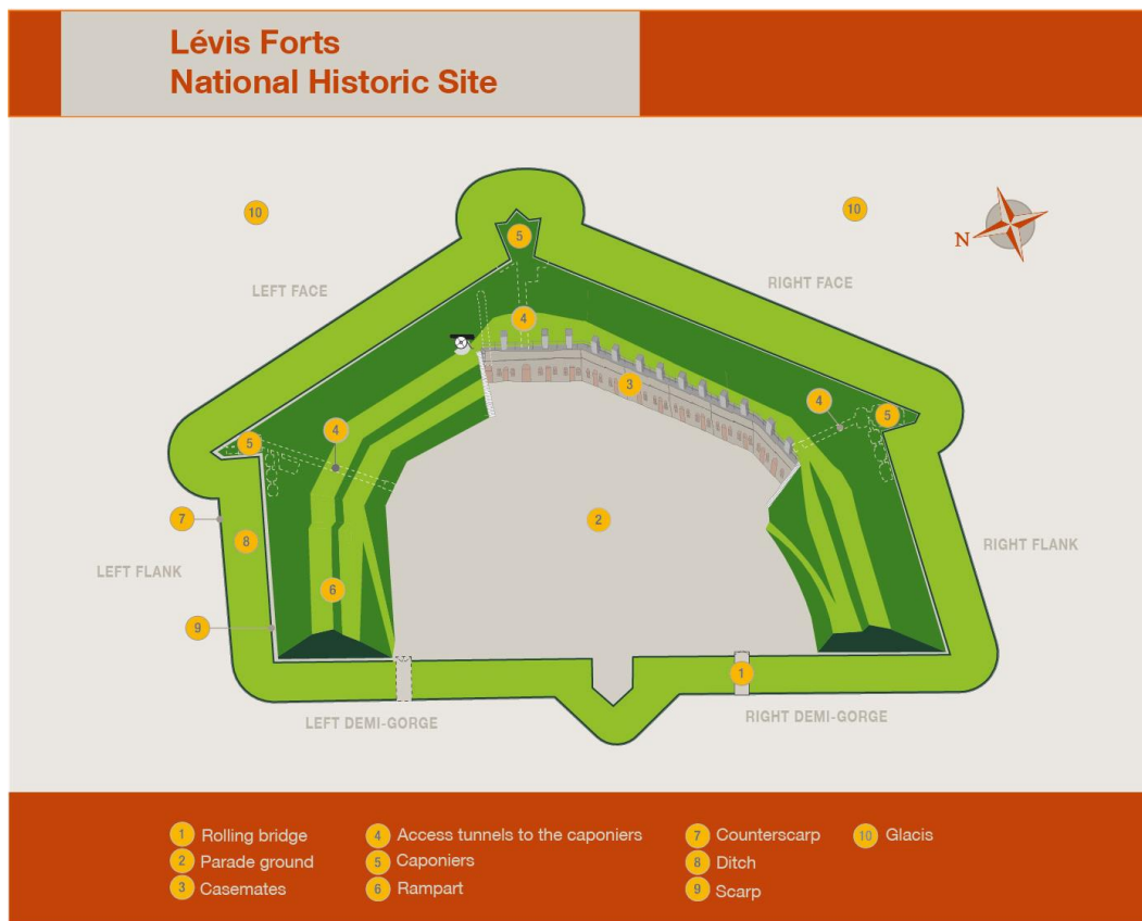
Map 3: Lévis Forts National Historic Site – Fort No. 1

The Lévis Forts National Historic Site is located in Lévis, on the south shore of the St. Lawrence River. It was designated as a national historic site due to its strategic importance to the defence of Québec City. It is made up of several components, mainly the three forts: forts No. 1, No. 2 and No. 3. They form a chain of military structures built between 1865 and 1872 to protect Québec City's surroundings and its port from potential attack from the United States. This is the only example in Canada of the system of detached forts built to defend the major cities of the British Empire during the second half of the 19th century. Parks Canada is the owner of Fort No. 1, the only fort that still remains today. The other elements that constitute this historic site belong to third parties.