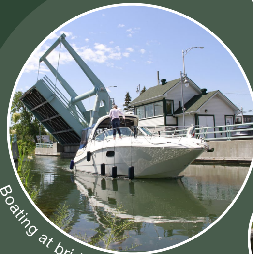
Boating at bridge no.9

Parks Canada has been working hard since the tabling in Parliament of the Chambly Canal National Historic Site Management Plan (2018) to achieve the strategic vision, despite the context of the COVID-19 pandemic (March 2020). In addition to repairing its infrastructure, animating the canal's banks, organizing cultural events, and developing judicious collaborations with a variety of local partners, the Agency is also working to address the many requests it receives from third parties on the canal property that have direct impacts on the safety of users and on the commemorative integrity of the Chambly Canal National Historic Site.