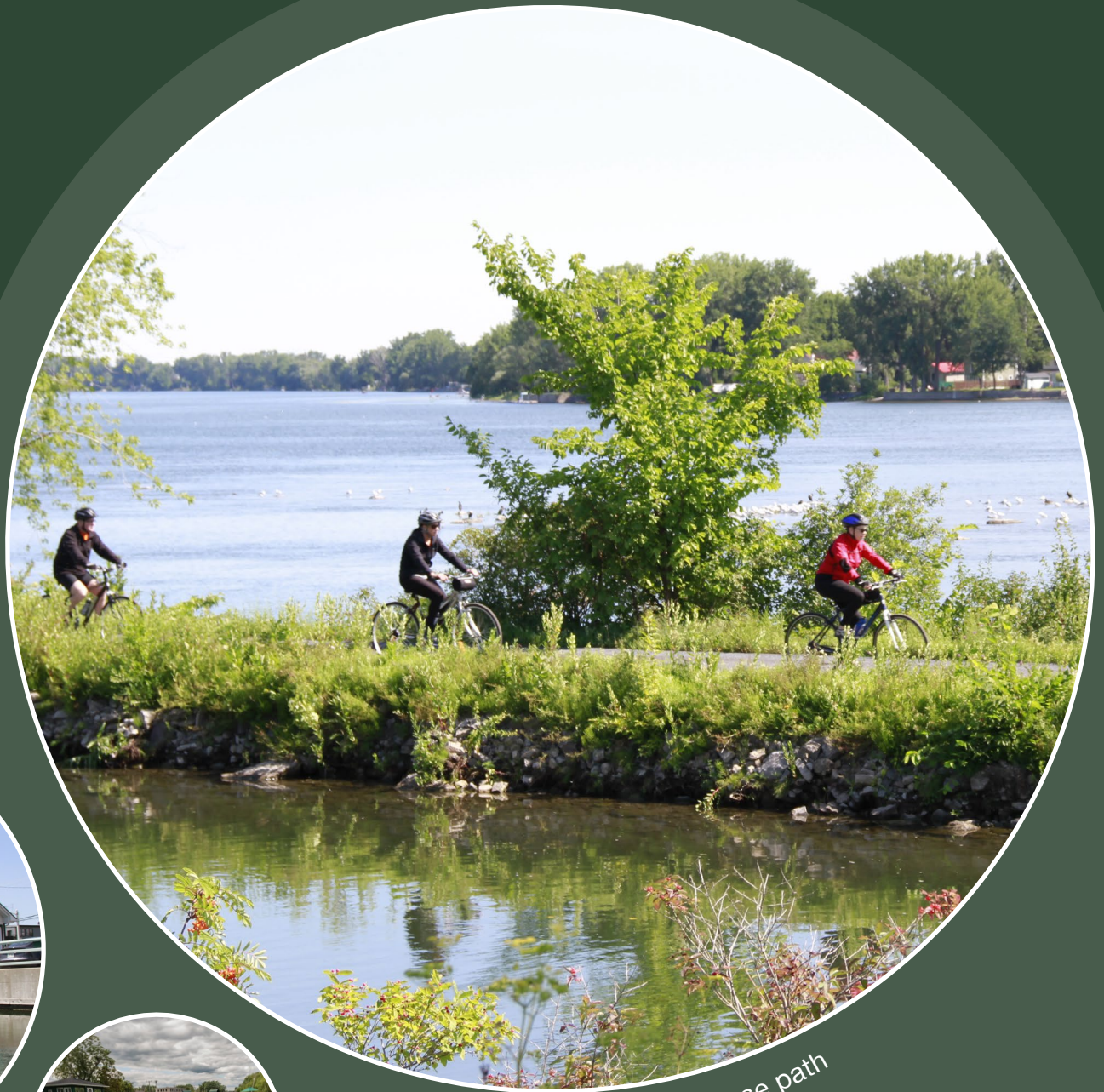
Cyclists on the multi-purpose path